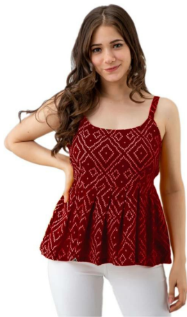
product 3 10 oct Red S